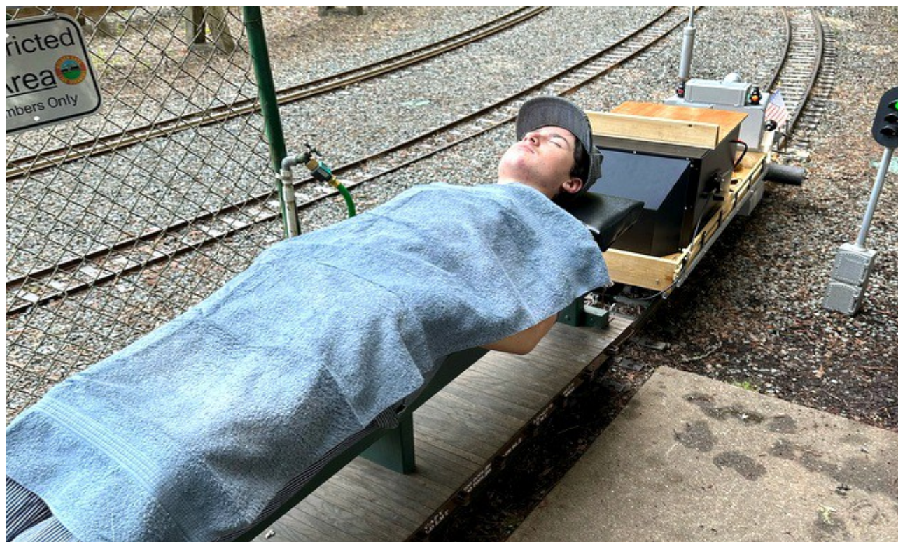
GGLS now provides sleeping cars in long, extra long and depressed. Try one today!