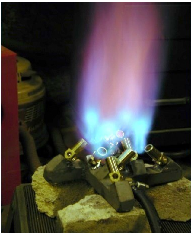
Not quite at full burner.

I recently supplied a friend with a larger impinged burner for a gorgeous antique coal stove that heats his home and we ended up plugging four of the jets to lower the amount of heat. It was already using the smaller type of jet burner but this type of fine tuning made it just what he needed.