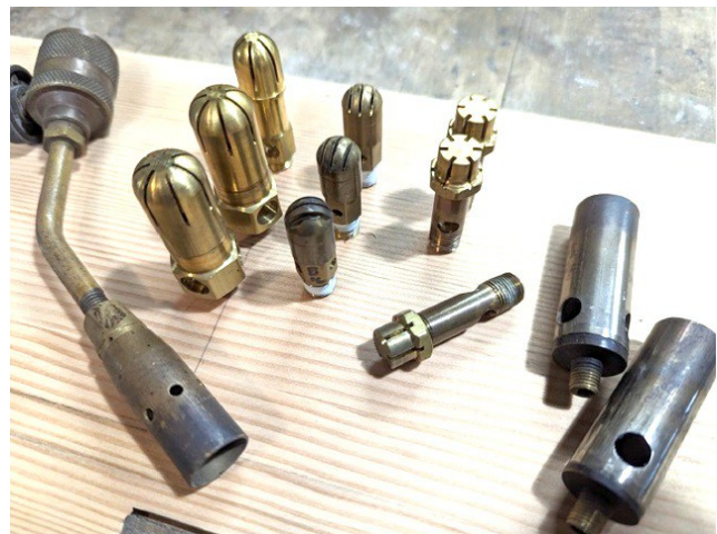
A group of barber jets, star & fan pattern. With a couple jet burners and a propane torch head as well.

Barber jets are a family of individually mixing units with various sizes & top caps to spread the air/gas mixing different patterns. The most commonly used is the star pattern. By making a manifold with mounting holes, arrays of burners can be created very easily and with some care the results are very successful. The burners need to have enough room around them for the flame pattern to do its job of mixing in the secondary air. For narrow fireboxes a fan pattern can be a better choice with the fans spreading across the width more burners can be utilized. I recently built a burner with a single row of 6 fan burners. Now it's 5 burners because the air coming into the burner caused the furthest burner to be starved & not mix the gasses well. The burner assembly worked better with fewer burners operating at higher levels.