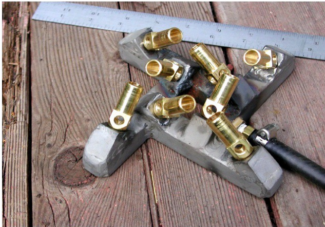
A home made 8 jet impinged burner with temporary gas connection for test.

This type of burner is very efficient & clean burning, it also seems to throttle well. This is a time when “crossing the streams” is a good thing. The mounting for the jets is more complicated but burner units made of cast iron are available through the internet. The obvious issue is that this type of burner needs a bit more height in the firebox.