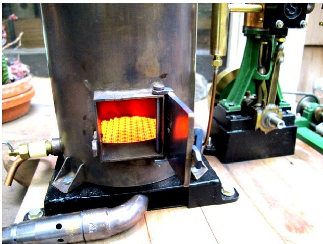
Here's a ceramic burner in a 4" diameter vertical boiler using a propane torch burner as a mixing system.

There are other types of propane gas burners: radiant types, ceramic & stainless, and jet burners, but they have not proven to be successful in our general size category. Ceramics are often used in G scale sizes and would be a possibility for 2" or 3.5" gauge locomotives.