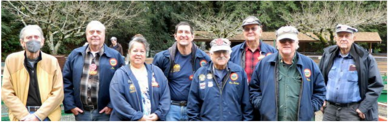
2024 Golden Gate Live Steamers Board Members